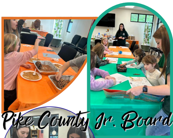
Pike County Jr. Board

Junior board members prepared for and participated in a youth agriculture educational camp day.