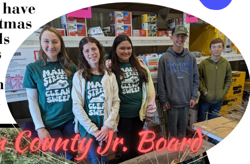
Anderson County Jr. Board

Jr. board members have been collecting christmas trees and light strands to be recycled. Trees are submerged in a body of water by Fish & Wildlife personnel for fish habitat.