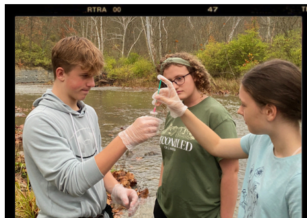
Boone County Jr. Board

Junior board members prepared for and participated in a youth agriculture educational camp day.