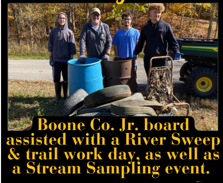
Boone Co. Jr. board assisted with a River Sweep & trail work day, as well as a Stream Sampling event.